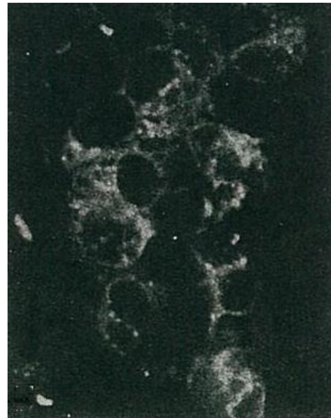
Fig. 2. Detection of HCV NS5a protein by immunofluorescence antibody staining. Chimp liver cells were infected with recombinant vaccinia virus containing a HCV genome cDNA. After incubation for 48 hr, the cells were fixed with acetone and HCV NS5a protein was detected by indirect immunofluorescence staining using this antibody.