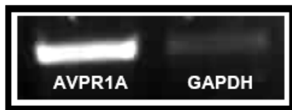
Fig.1. AVPR1A and GAPDH housekeeping gene RT-PCR.

Our expression plasmid contains the coding sequence of human AVPR1A receptor protein. Our plasmid was transfected in HEK293 cells. Resistant clones were obtained by limit dilution and receptor gene expression was tested by RT-PCR using GAPDH as internal control (Fig.1).