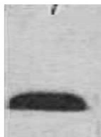
Fig: Western blot analysis of Zebrafish skeletal muscle with Anti-Histone H3 Monoclonal Antibody(2D9) at 1:2000 dilution.

Note: The product listed herein is for research use only and is not intended for use in human or clinical diagnosis. Suggested applications of our products are not recommendations to use our products in violation of any patent or as a license. We cannot be responsible for patent infringements or other violations that may occur with the use of this product.